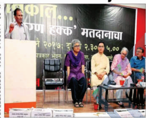
The voting took place in various parts of Pune district from June 15 to June 30.